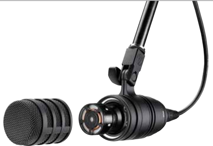
Optimized capsule placement