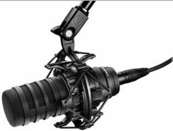
AT8484 Shock Mount (optional accessory)