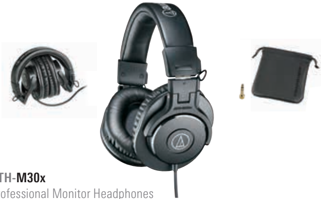
ATH-M30x Professional Monitor Headphones

ATH-M30x professional monitor headphones combine modern engineering and high-quality materials to deliver a comfortable listening experience, with enhanced audio clarity and sound isolation. Tuned for highly detailed audio, with strong mid-range definition, these versatile monitoring headphones are ideal in a variety of situations.