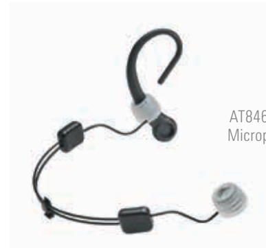
AT8464x Dual-Ear Microphone Mount

included accessories: AT8545 power module (wired only); AT8464x dual-ear microphone mount; AT8440 cable clip; two AT8157 windscreens, AT8171 windscreens; two AT8156 element covers; moisture guard; belt clip (wired only); carrying case.