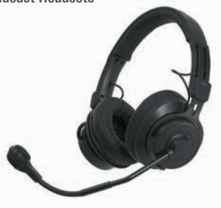
BPHS2 (with unterminated cable BPHS2-UT ) Broadcast Stereo Headset with dynamic microphone