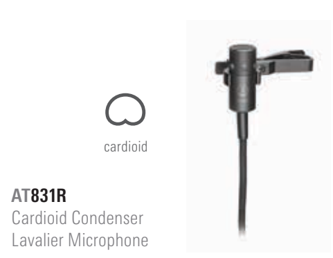
AT831R Cardioid Condenser Lavalier Microphone

Also terminated for Audio-Technica wireless systems.