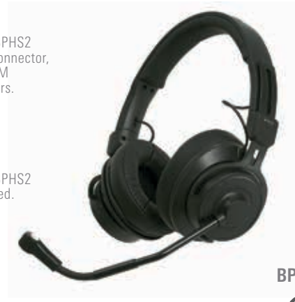
BPHS2C (with unterminated cable BPHS2C-UT ) Broadcast Stereo Headset with condenser microphone

Replacement cable for BPHS2 (all models), unterminated.