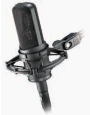
AT4050ST Stereo Condenser Microphone