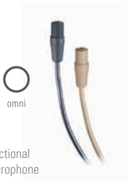
AT899 Subminiature Omnidirectional Condenser Lavalier Microphone