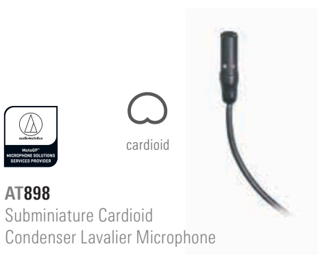
AT898 Subminiature Cardioid Condenser Lavalier Microphone