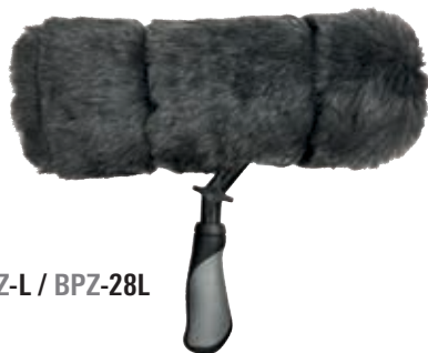
BPZ-L / BPZ-28L