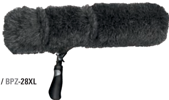
BPZ-XL / BPZ-28XL