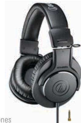
ATH-M20x Professional Monitor Headphones

frequency response: 15–22,000 Hz included accessories: 6.3 mm (1/4") adapter, protective pouch.